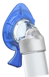
With anti-asphyxia valve

Transparent retaining ring and elbow. Vented adapters have an integrated expiration system and include an anti-asphyxia valve. The special shape of the retaining ring and mask body creates a gap where the expired air can escape. The reusable version is equipped with an additional pressure measurement port and a rotating sleeve.