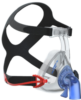
Single-use mask with non-vented adapter without anti-asphyxia valve

The full face masks are intended for spontaneously breathing patients requiring respiratory support by noninvasive ventilation (NIV). The product portfolio includes a range of masks in three sizes (S, M, L): single use, reusable, vented, and non-vented with or without an anti-asphyxia valve.