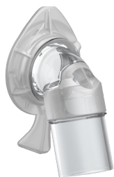
For single-use NIV masks