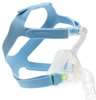
Reusable mask with vented adapter and anti-asphyxia valve