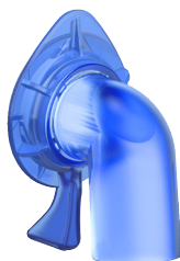
Without anti-asphyxia valve