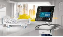
Picture 1: HAMILTON-C6 in the ICU (horizontally)